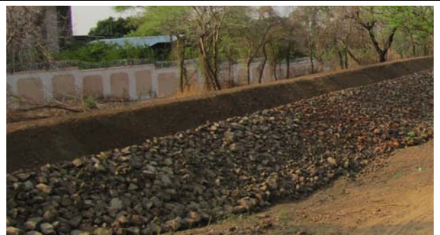
Earthen Nala Bandh