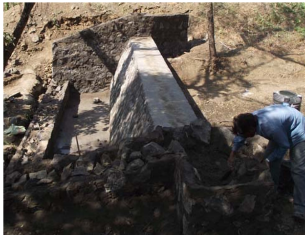
Cement Nala Bandh