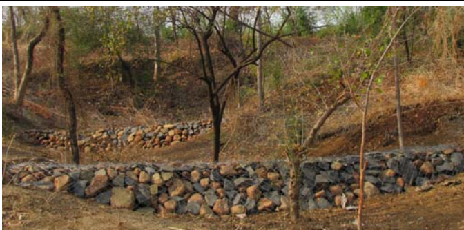
Loose Boulder Structure