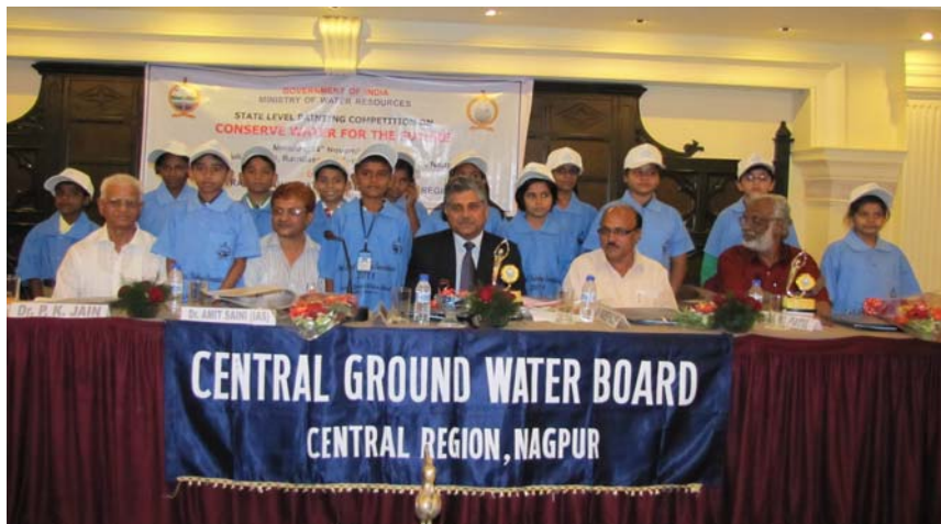
Group photograph of the first, Second, Third and 10 consolation prize winners with jury members.