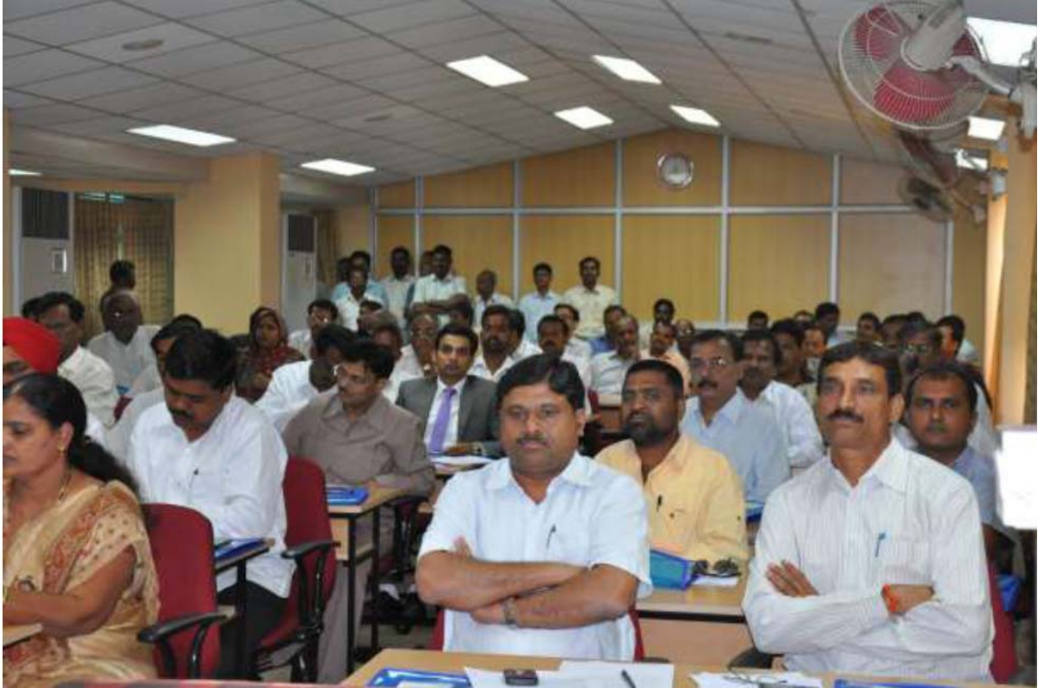
The representatives of the Panchayat Raj Institutions attending the Consultation Meeting for Review of National Water Policy

Shri P.K. Bansal, Honorable. Union Minister of Water Resources, Govt. of India, New Delhi presided over the consultation meeting with the Panchayati Raj Institutions on review of National Water Policy. Shri Sourabh Gupta, Scientist-D and core, SUO, Pune attended the meeting.